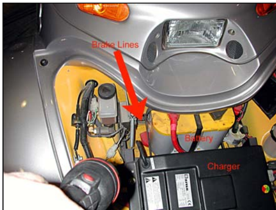
Inadequately secured brake lines on Left Side